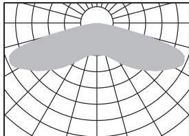
LS12 ME600 Lighting for one or two-sided arrangement of poles, also with lower mounting heights and larger distances