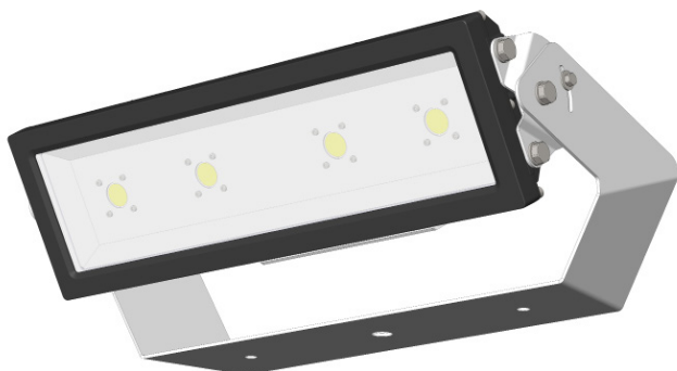
Picture shows variant flood light FU