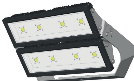
Picture shows variant flood light FU